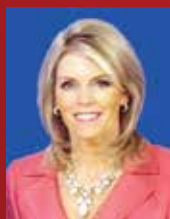
HONORARY CHAIR AND EVENT HOST

offers each guest a wonderful evening of fun and enchantment including dining, dancing, a chance to win a beautiful diamond provided by H&H Jewelry and Design, a live auction and a tree auction, caricature artists, fun pictures in the photobug PHOTO BOOTH, having your fortune told by genuine psychics, magician fun, UnoDeuce video booth and even a professional Hoffman photo with Santa himself!